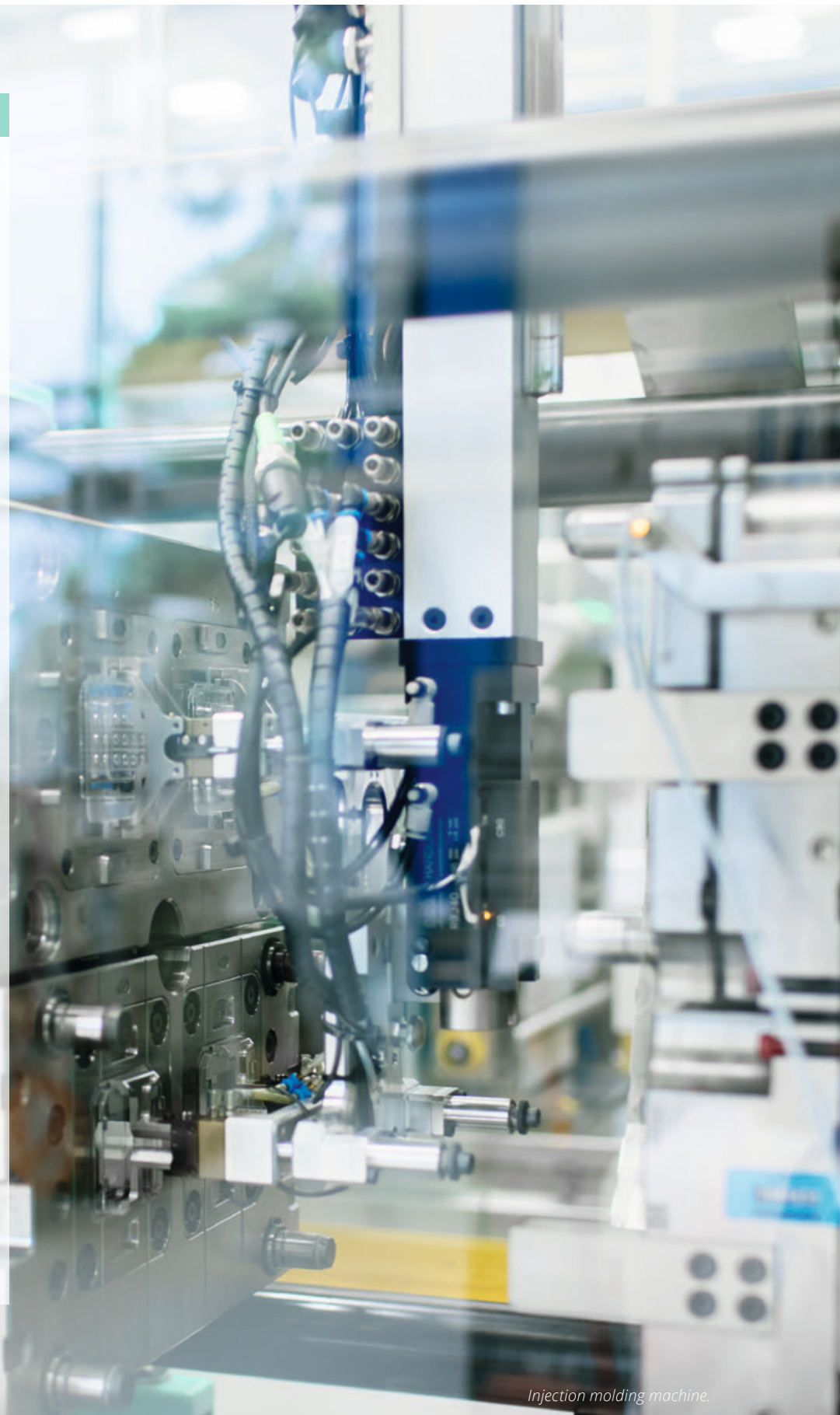
Injection molding machine.

The auditor's report on the statutory sustainability report can be found on page 9. Please refer to the inside cover for further information.