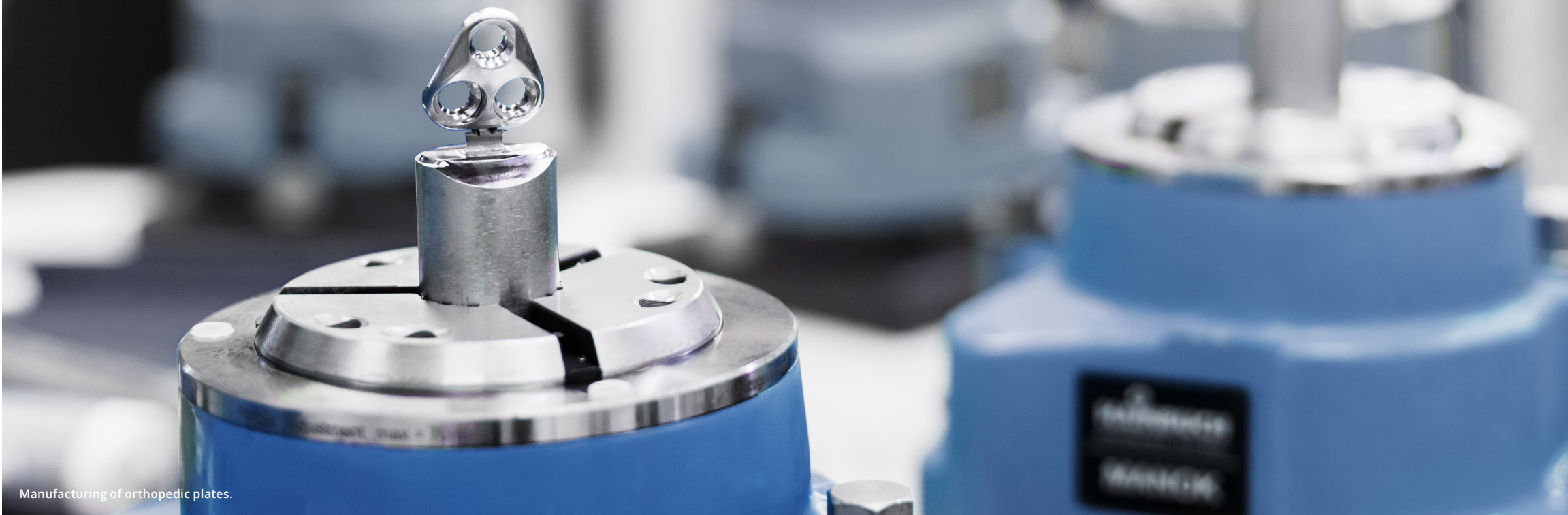
Manufacturing of orthopedic plates.

>> We operate in many locations across the world, and our employees represent a vast diversity of cultures and backgrounds. With this comes great responsibility - both locally and globally. Therefore, we strive to make a positive contribution to the communities in which we are active, and we aim to minimize our environmental impact.