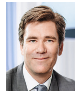
CEO Jan Wahlström

>> Care is a strategic concept as we aim at fulfilling our sustainability goals within our focus areas: Care for our Business, Care for our People, and Care for our Responsibility. During the year, we achieved our goal of a scrap rate below 5 percent. We have also succeeded in reducing energy consumption and we investigate using renewable energy where possible. Our sustainability work in China took a step forward in 2019. A new water purification system was put into full operation, resulting in significantly reduced water consumption.