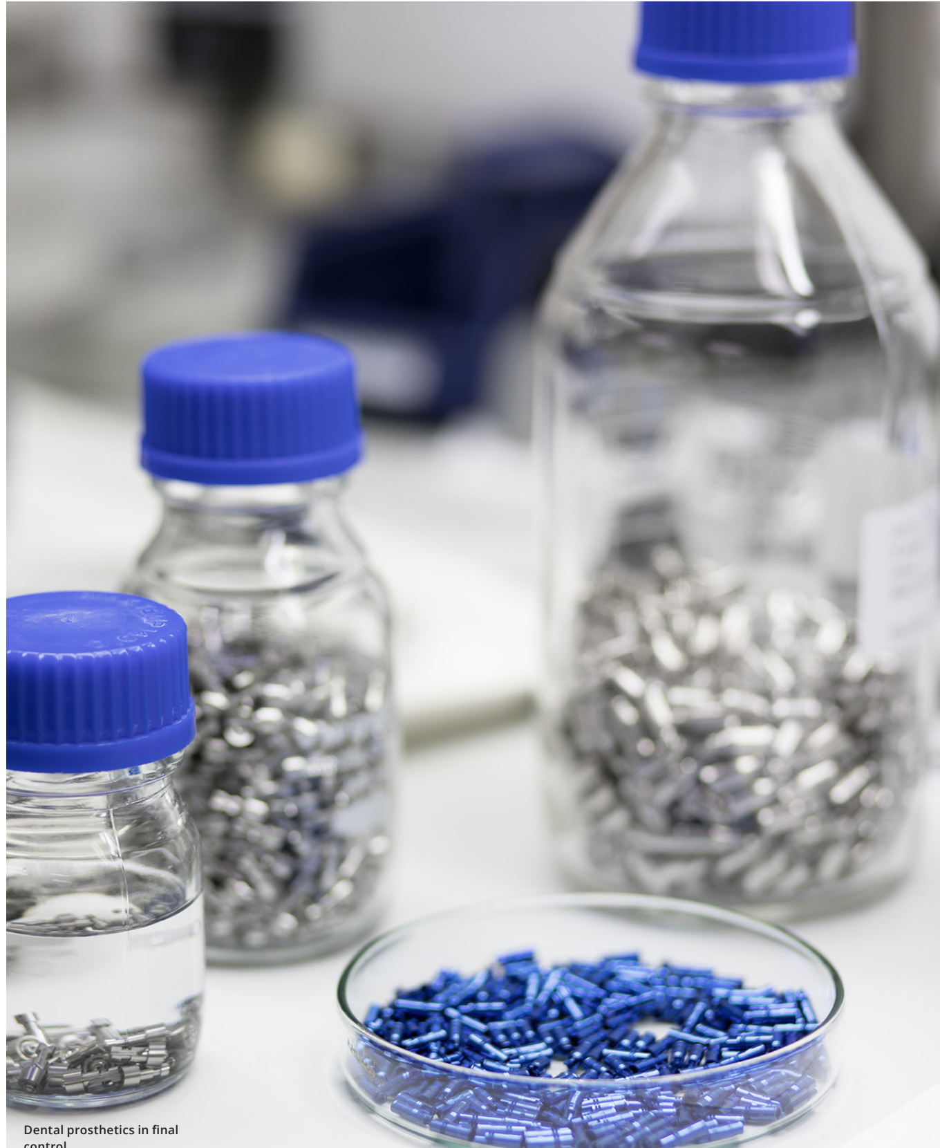
Dental prosthetics in final control.